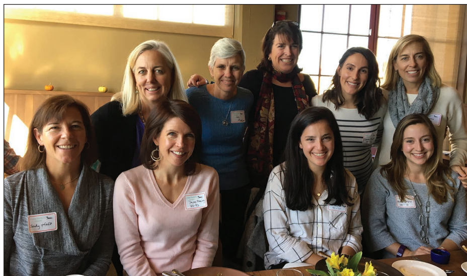
San Francisco Alumni Gathering, December 2016