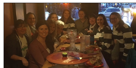
Manchester Gathering, April 2017