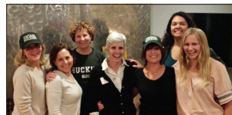
Los Angeles Alumni Gathering, December 2016