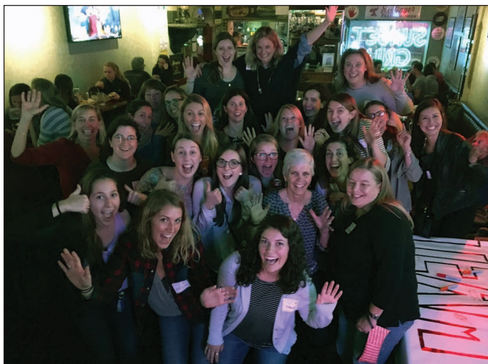
Above: Boston Gathering, October 2016