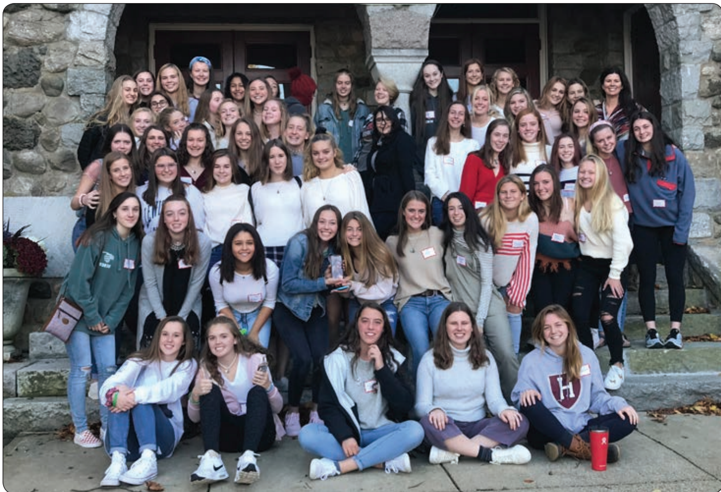
The Leadership Division Reunion was held on November 2, 2019 in Lexington, MA, for girls in our 9th and 10th grade program in 2019.