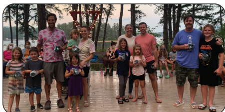
Family Camp 5 Year Hucksters