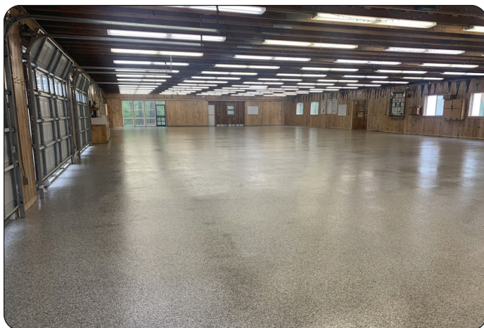
The dining hall is more beautiful, inside and out.