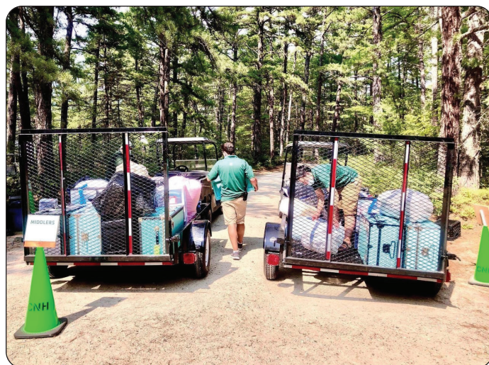
On the move!

Thank you to our Maintenance Team who do not stop and whose work keeps Camp Huckins Constant and True!