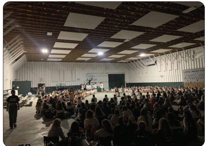
Acoustic panels have made all the difference at the Snell Dome.