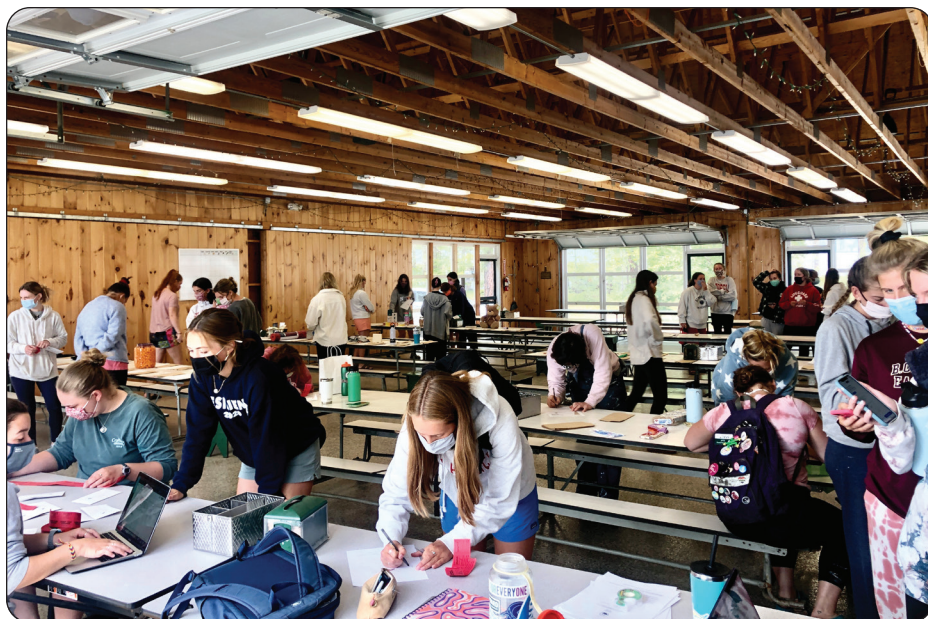
Staff members donated items and bought raffle tickets.