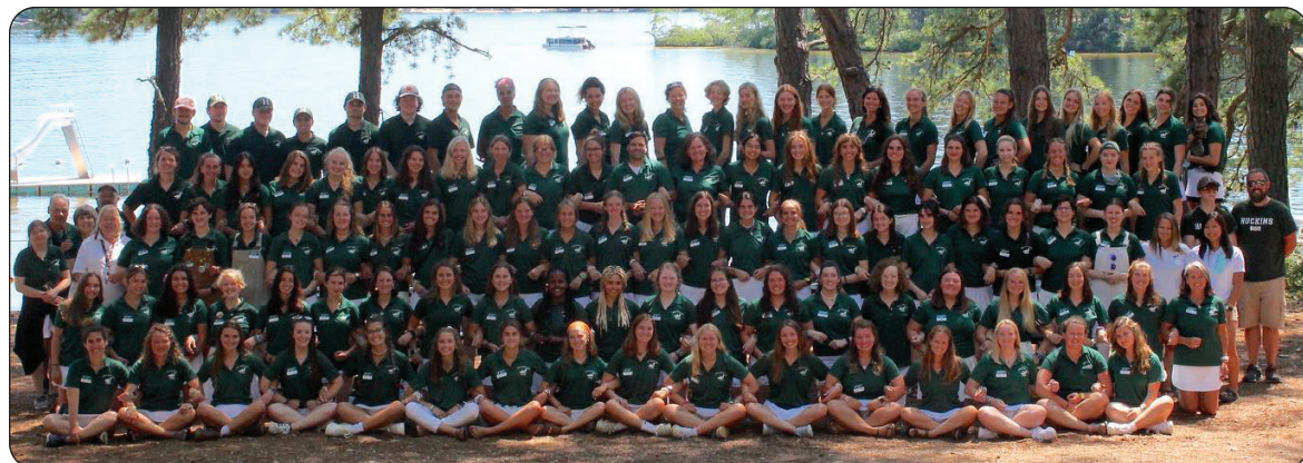
2021 summer staff.

I am so grateful to be a part of this remarkable community and proud of what we accomplished. Thanks to all that helped us make it happen!