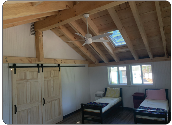
The Health Center is a light and airy space perfect for recuperating campers.

The second project included improvements to the Snell Dome, our Sports Complex. For all of you who have experienced being in the Snell Dome during a rainstorm, you can appreciate how loud it can be. The existing roof was removed and replaced with a Zip (plywood) and shingle system. In addition, the interior of the complex was outfitted with acoustic sound panels. These updates allowed us to have a quieter space for the whole Camp to