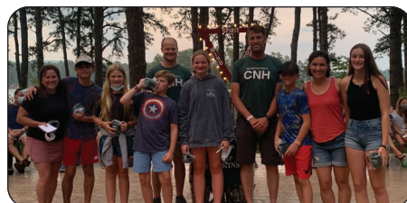
Family Camp 10 Year Hucksters