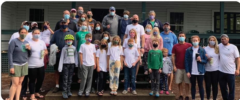
Above: Group 1; below: Group 2