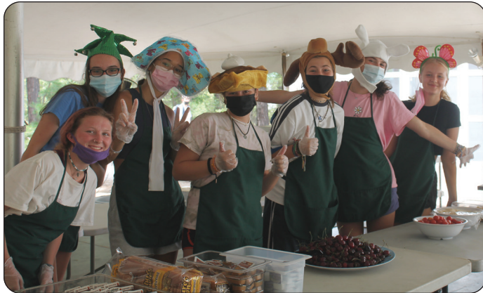
"W" servers during Crazy Hat Lunch.