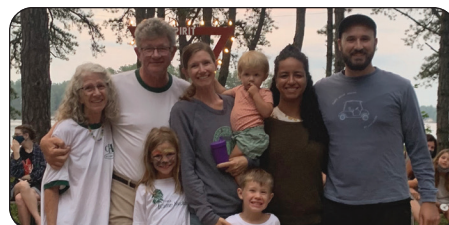
Family Camp 30 Year Hucksters