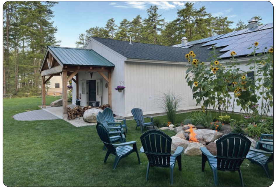
Front of Dining Hall with firepit and sunflowers.

The Sportsfield and Sports Complex have also benefited from thoughtful landscaping improvements this year. The 2017 Master Plan called for the trees between the field and complex to be removed to generate added playing field space and to connect the Sportsfield with the Sports Complex. After the clearing, the team reclaimed