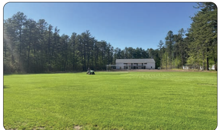
The Sports Complex from the Sports Shed.