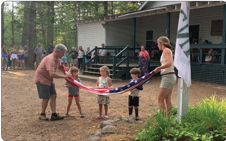
Three generations work together lowering the flag during Family Camp.

The Huckins Board of Directors was fully engaged throughout the year, sharing valuable perspectives to guide decision making and planning. Alumni joined staff in June to open camp – moving boats, mooring floats, cleaning the Craft Shop and Sports Shed, and expanding the camp garden. Many hands really do make light work!