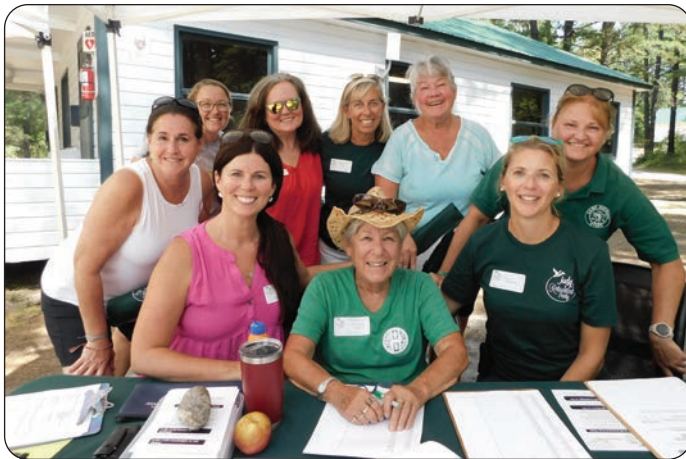
Some of the 50 volunteers who helped out with the event.