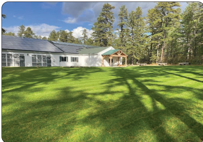
New grass in front of the Dining Hall.