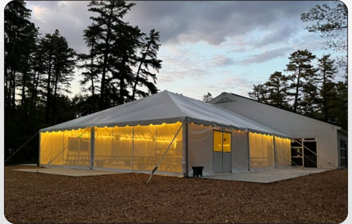
Dining Hall tent and slab

Our food program accounts for one of the biggest parts of campers and staff’s day. Our community gathers 3 times