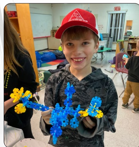
Creativity abounds at after-school programs for Freedom children