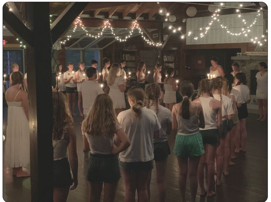
Generations of Huckins campers have passed through the Program Lodge

Many of the Simmonds family have attended Huckins including siblings,