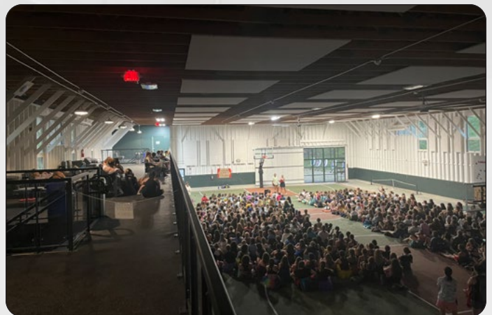
The Sports Complex in action

As we look ahead in our Master Planning, we will continue to focus on improvements that will have a positive impact on camper, family, and staff experiences, and that will advance our Strategic Priorities.