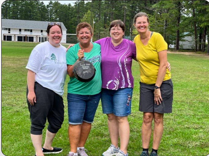
Friendship Circle, continued