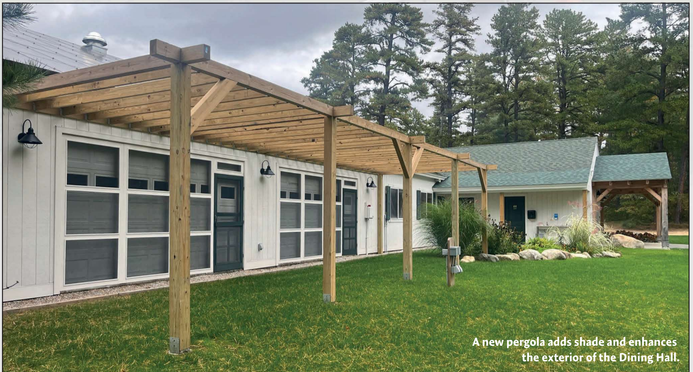
A new pergola adds shade and enhances the exterior of the Dining Hall.