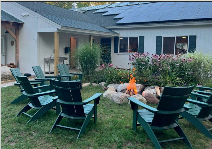
A new firepit, flowers, and chairs were added for a new space for campers and counselors to connect.